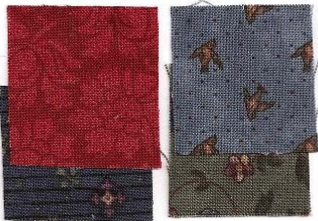
"Wildflower Serenade II" By Kansas Troubles from Moda