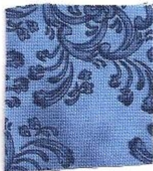
"Charlotte" * by Debbie Beaves - Kits too