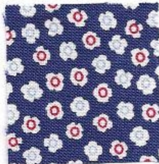
"Playtime with Sue & Bill" also a cute childrens panel